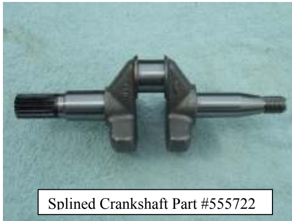
Splined Crankshaft Part #555722