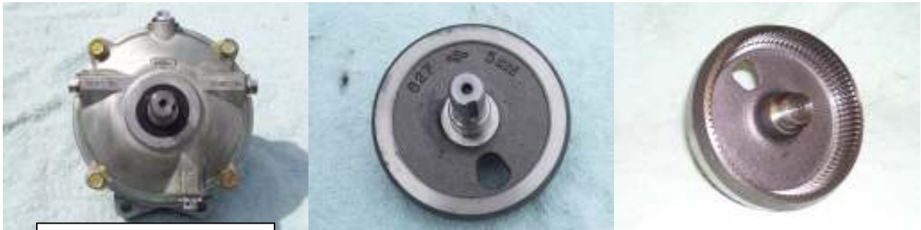
Part # 555721 complete gear box