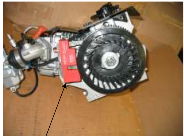
Red Coil Only - No Other Allowed