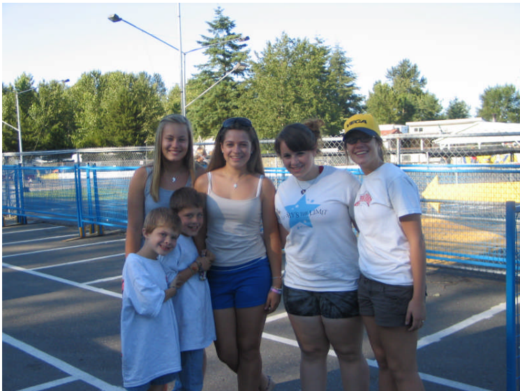
The Pit Boss, the Pit Posse and their avid admirers!